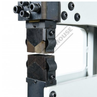
Stretching Dies Shown on Machine