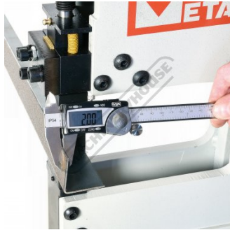
2mm Mild Steel Capacity