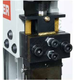
Top Die Holder