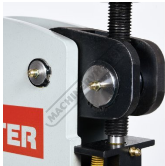
Head Pivot Points with Grease Nipples