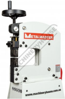
Head Side View