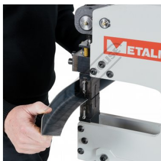
Stretching Dies In Action 2mm Mild Steel