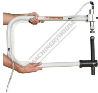
Hand held planishing