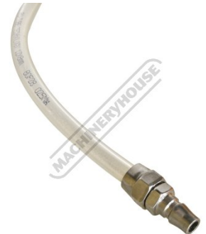
Air in Adaptor