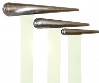
S2232 Tapered Steel T-Dolly Set - 3 Piece