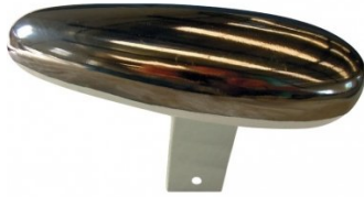
S2236 Oval Steel Dolly