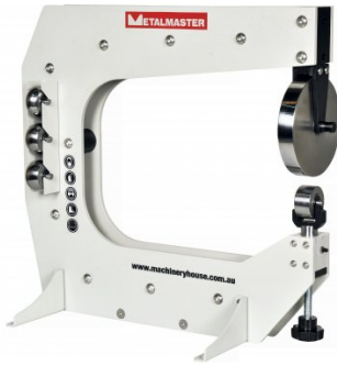
S2245 English Wheel