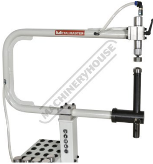
Large throat capacity 610mm deep and 362mm height