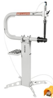
S2277 Pneumatic Planishing Hammer On Stand