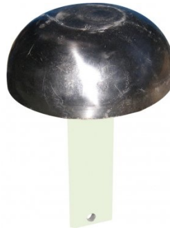
S2237 Bowl Steel Dome Dolly