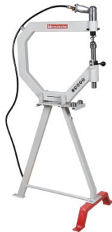
S227A Pneumatic Planishing Hammer