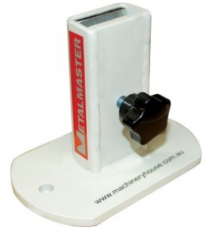
S2239 Dolly Stand Holder