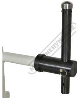
Lower die holder