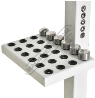
24 Die tray holder