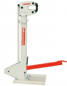
S2264 Foot Operated Shrinker Stretcher - Oval Jaws