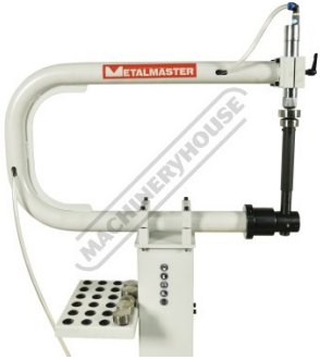
Large Throat Capacity 710 360mm Height