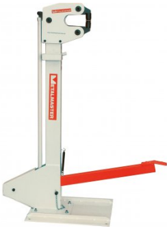
S2264 Foot Operated Shrinker Stretcher - Oval Jaws