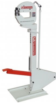
S2266 Foot Operated Shrinker Stretcher - Heavy Duty