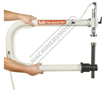
Show in Hand Held Planishing