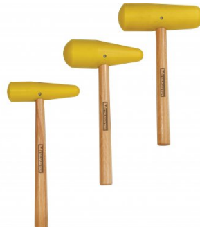
H896 Nylon Bossing Mallet Set - Tapered & Radius Ends