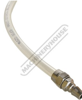
Air in Adaptor