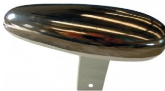
S2236 Oval Steel Dolly