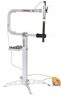
S2275 Pneumatic Planishing Hammer On Stand