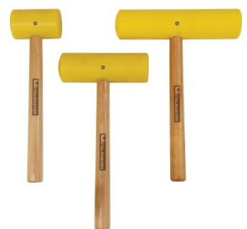
H895 Nylon Bossing Mallet Set - Flat & Radius End