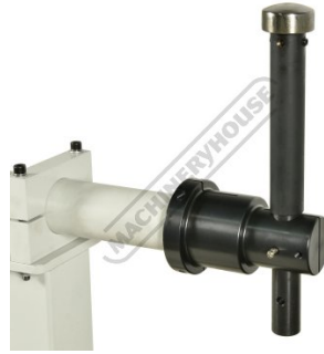
Lower Die Holder