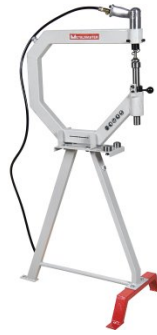
S227A Pneumatic Planishing Hammer