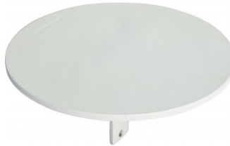
S2240 Round Steel Table for Sand Bag