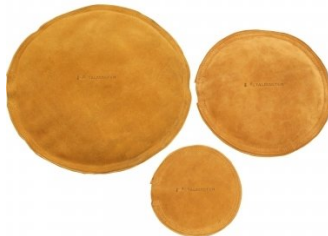
S210 Round Leather Bags - Sand Filled