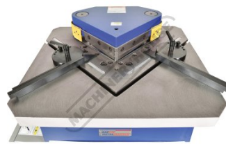
Top Close Up