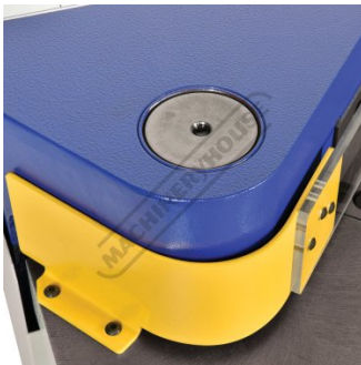
Heavy Duty Pins