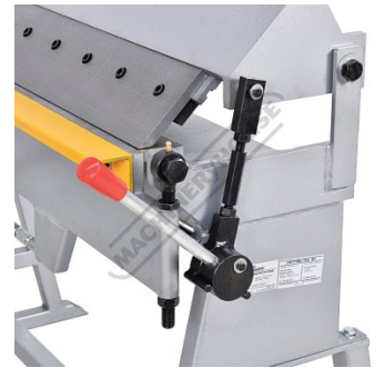
Material Clamp Blade Lever Down