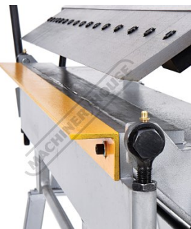
Removable Lower Bending Support Angle