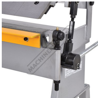
Lower Bending Leaf Height Adjustment