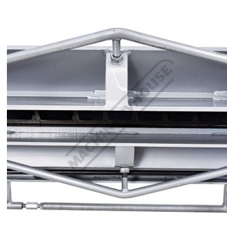
Crown Adjustment Rear View CloseUp