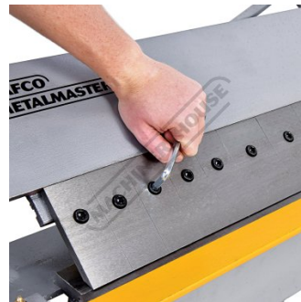
Removable Fingers Action Hex Key