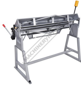
Rear Left View