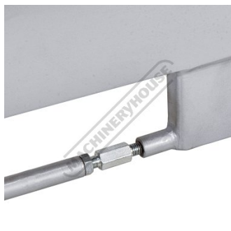
Crown Adjustment Rod