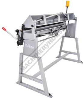
Rear Left View 2