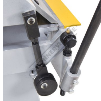
Lubrication Points Left Side