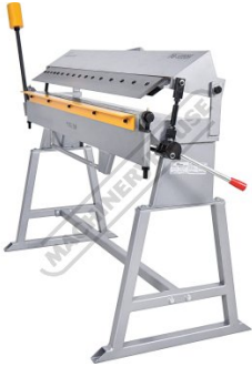
Material Clamp Blade Up