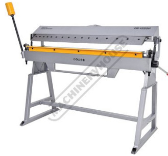
Shown with Material Clamp Blade Up