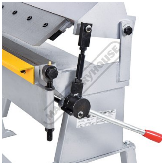
Material Clamp Blade Lever Up