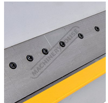
Removable Fingers for Bending Pans or Boxes