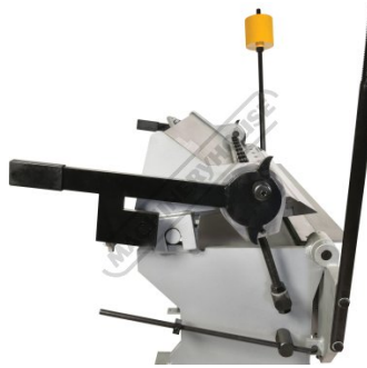
Material Clamp Blade Lever