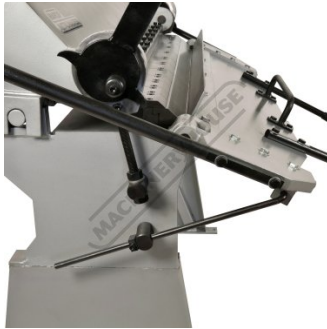
Adjustable Apron Stop