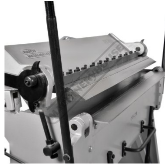
1250mm Material Clamp Capacity