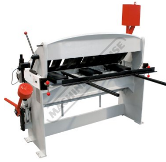
Rear Back Gauge