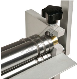
Wire Groove Rolls