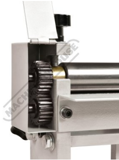
Gear Driven Rolls