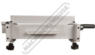
Bench or Vice Mount