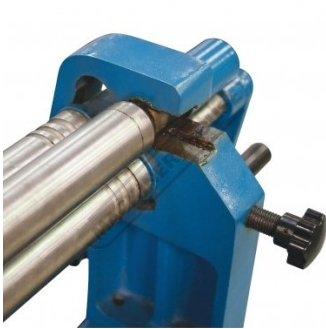
Rolls with Wire Grooves