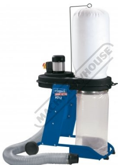
Recommended To Be Use With A Dust Collector