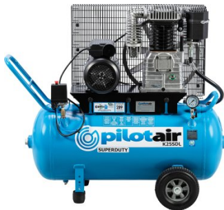
C511 Pilot Super Duty Air Compressor