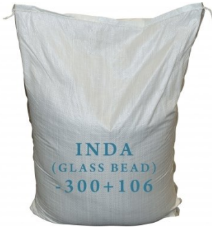
S297 Sandblasting Beads - Inda