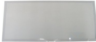
SC004 PVC SHEET PKT 5