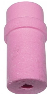
6SC0061 NOZZLES 6.0MM PKT 2