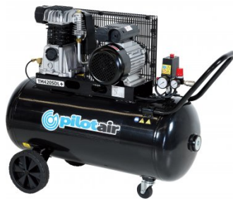
C5051 Pilot Air Compressor