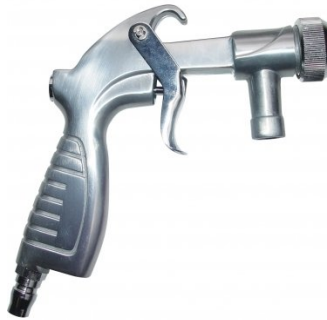
6SC0042 SANDBLASTING GUN