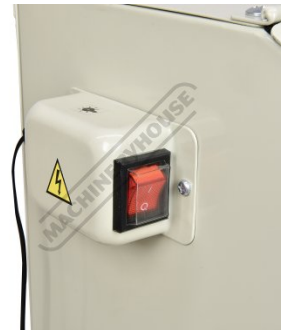
Switches for Light and Dust Collector