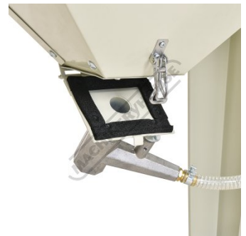
Hopper Emptying Hatch