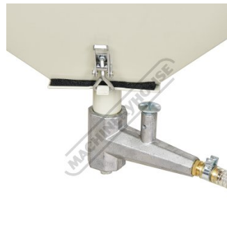
Abrasive Measuring Valve