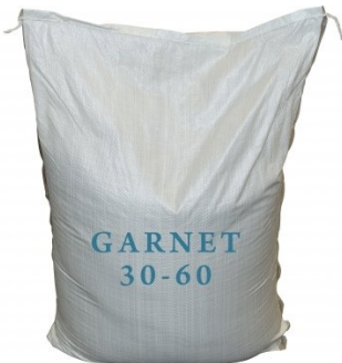
S296 Sandblasting Beads - Garnet