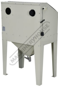
Rear Right View