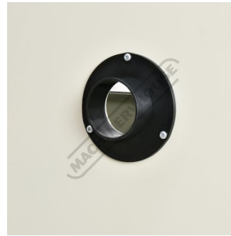
Dust Collector 63mm Outlet