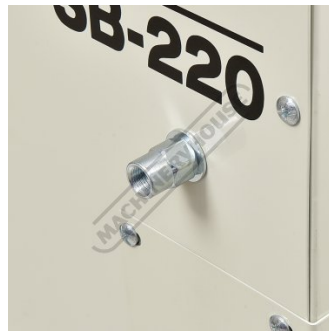
Compressed Air Inlet Connection