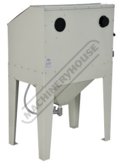
Rear Left View