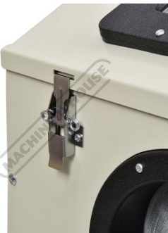
Lid Open Latch