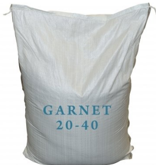
S295 Sandblasting Beads - Garnet