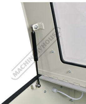
Gas Strut Door