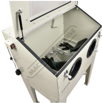
Hopper with Removable Grates