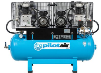
C515 Pilot Super Duty Air Compressor