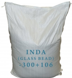
S297 Sandblasting Beads - Inda