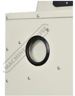
Air Intake Breather