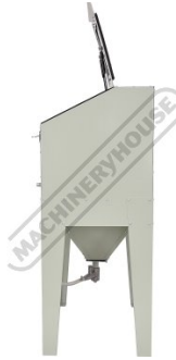
Side View Lid Open