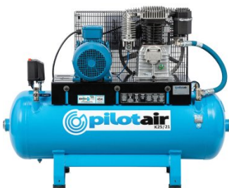
C521 Classic Industrial Series 3 Phase Reciprocating - Pilot Air Compressor