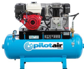
C507 Classic Industrial Series Trade Petrol Reciprocating - Petrol Powered - Pilot Air Compressor