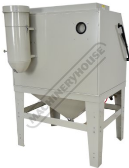
Rear Right View