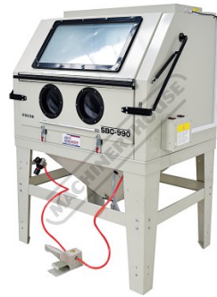
Side View Lid Closed