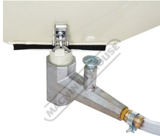
Abrasive Metering Valve