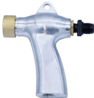
3SC0300 SANDBLASTING GUN