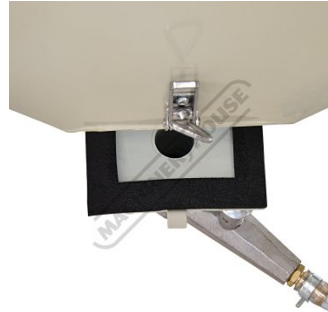
Hopper Emptying Hatch