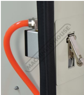
Door Safety Interlock