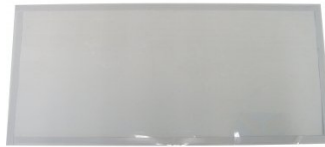
7SC0024 PVC SHEET PKT 4