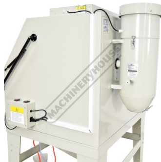
Rear Right View Close Up