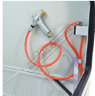
Gun on Hanging Hook