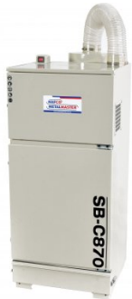
S310 Industrial Sandblasting Dust Cyclone Extractor