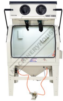
Front View Lid Open