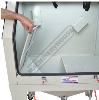
Hopper with Removable Gates