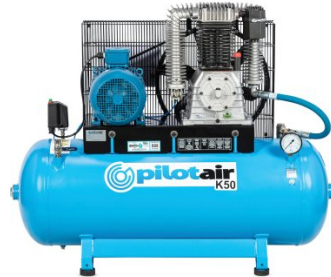
C529 Classic Industrial Series 3 Phase Reciprocating - Pilot Air Compressor