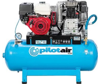
C509 Classic Industrial Series Trade Petrol Electric Start Reciprocating - Pilot Air Compressor