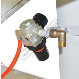
Compressed Air Inlet Connection