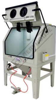
Side View Lid Open