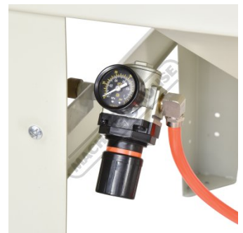
Air Pressure Gauge