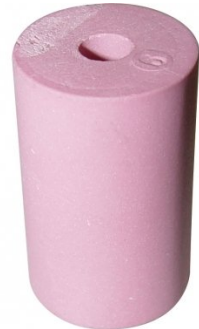
3SC0206 CERAMIC NOZZLE 6MM PKT 2