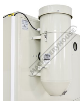
Dust Collector and Filter System