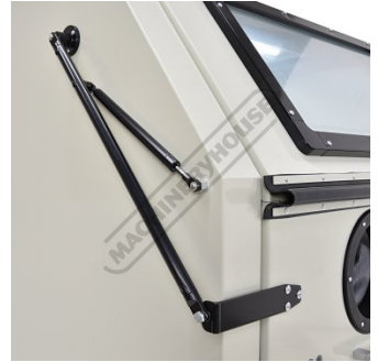
Gas Strut Door