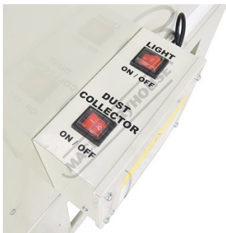
Switches for Light and Dust Collector