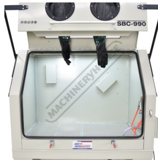
Inside Work Area