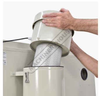
Removing Motor Filter Assembly