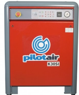
C542 Silenced Pilot Air Compressor