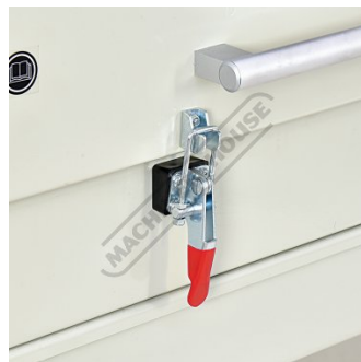
Lid Open Latch