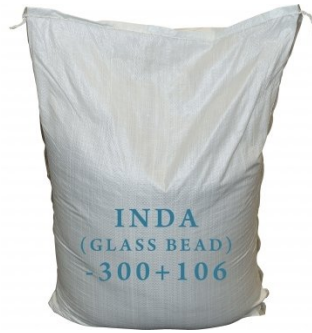
S297 Sandblasting Beads - Inda