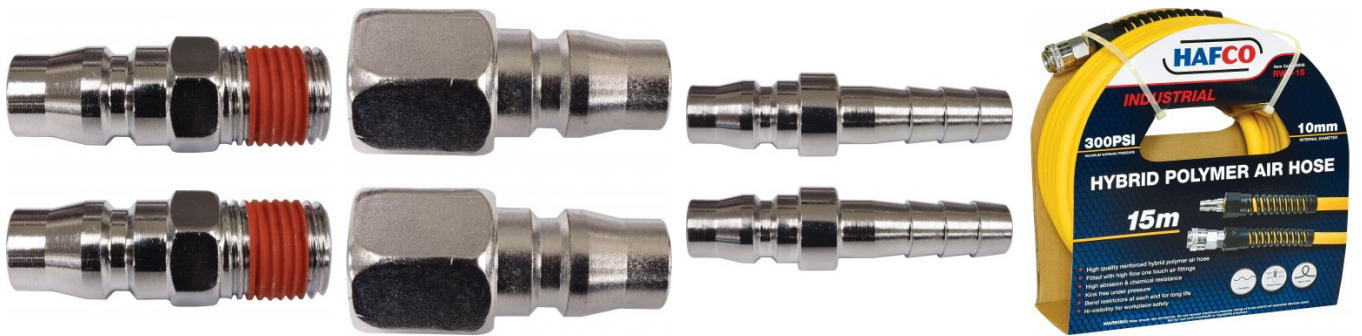
H008 Industrial Polymer Air Hose