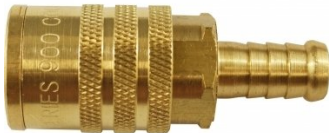
F912 Air Fittings