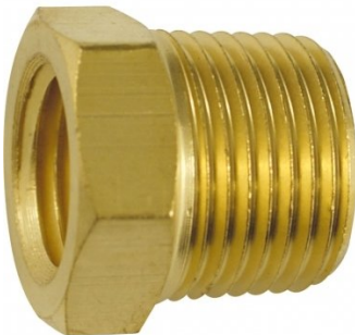
F832 Air Fittings