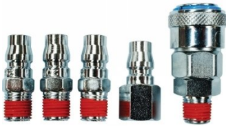
F935 High-Flow Air Fittings