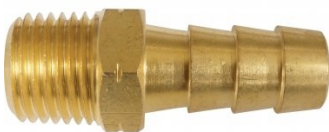
F803 Air Fittings