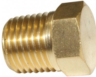
F870 Air Fittings