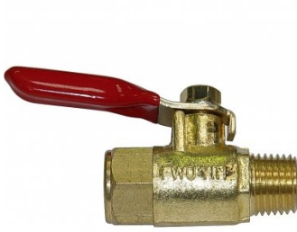
F930 Air Fittings