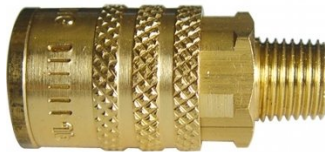
F901 Air Fittings