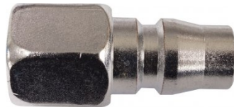
F950 High-Flow Air Fittings