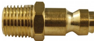
F902B Air Fittings