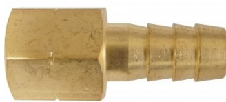
F811 Air Fittings