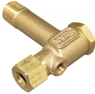
A230A Air Fittings