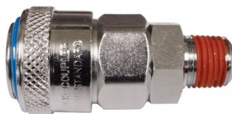
F941 High-Flow One Touch System Air Fittings