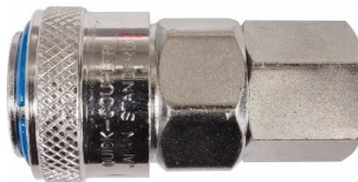
F945 High-Flow One Touch System Air Fittings