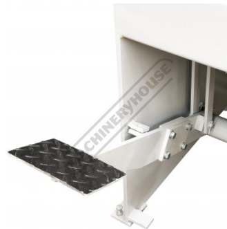
Foot Pedal Lever