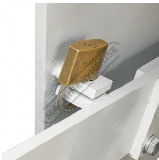
Isolation Tabs Shown Locked with Optional Padlock