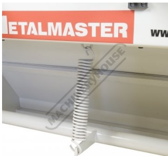
Spring Return Clamp Beam & Foot Pedal