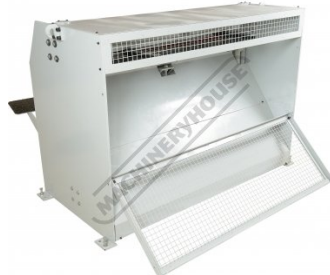
Rear Swivel Safety Guard