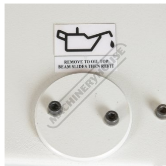
Oil Refil Points