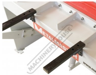
Front Sheet Support