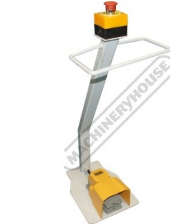
Roving Foot Pedal with Emergency Stop