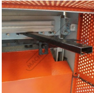
Rear Back Gauge