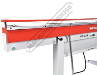
Material Clamp Up