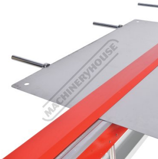
Material Length Stop