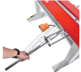
Bend Angle Guide Stop