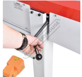
Material Clamp Lever