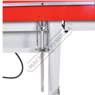
Bend Angle Guide