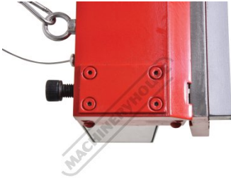
Material Thickness Clamp Adjustment 1