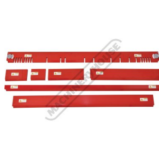
Included Material Clamp Bars