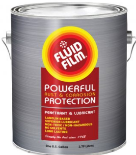
O044 Rust & Corrosion Preventive