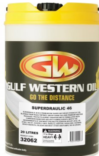
O004 Superdraulic ISO 46 Hi Temp Hydraulic Oil