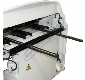
Rear Back Gauge