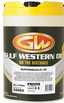
O004 Superdraulic ISO 46 Hi Temp Hydraulic Oil