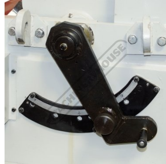
Rapid Blade Adjustment For Material Thickness