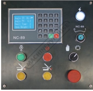
NC 89 Control Panel