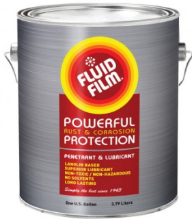
O044 Rust & Corrosion Preventive