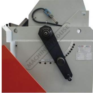
Rapid Blade Adjustment For Material Thickness