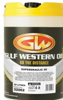
O004 Superdraulic ISO 46 Hi Temp Hydraulic Oil