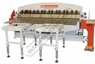
Shown with Optional Ball Transfer Tables - Order Code (L840)