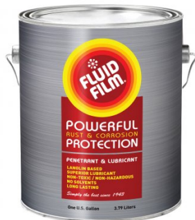
O044 Rust & Corrosion Preventive