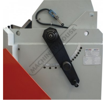
Rapid Blade Adjustment For Material Thickness