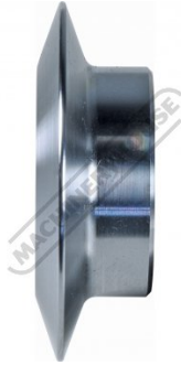
Art Wheel Die Side View