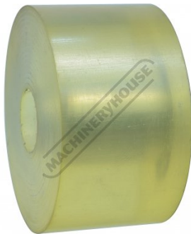
Polyurethane Lower Wheel