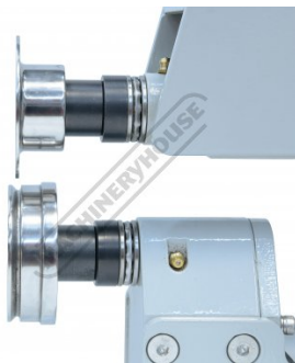
Lower Edge Forming Die with Knife Edge Tipping Die Side View