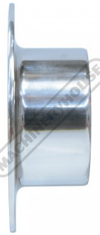
Knife Edge Tipping Die Side View