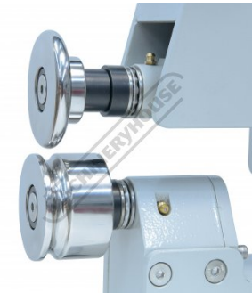
180 Degree Lower Die with 3 8 Inch Tipping Die