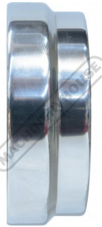
Lower Forming Die Side View