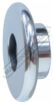
3/8 inch Tipping Die