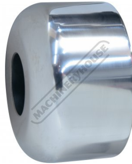
Round Tipping Die