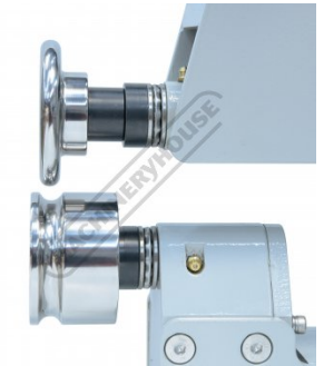
180 Degree Lower Die with 3 8 Inch Tipping Die Side View