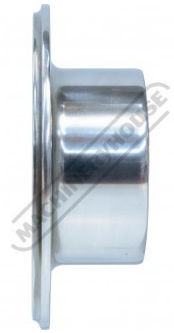
Outside Offset Die Side View