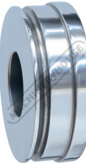
Lower Edge Forming Die