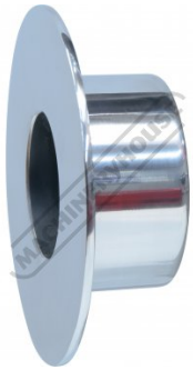
Knife Edge Tipping Die