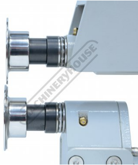
Inside Offset Die with Knife Edge Tipping Die Side View