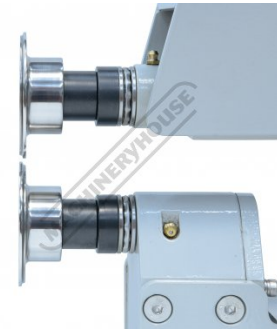
Inside Offset Die with Outside Offset Die Side View