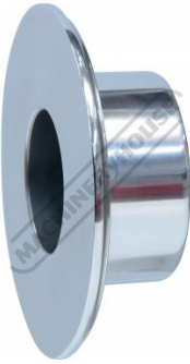
Inside Offset Die