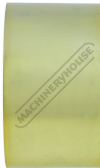
Polyurethane Lower Wheel Side View