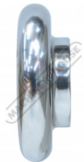
1/2 Inch Tipping Die Side View