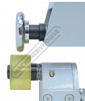
Polyurethane Lower Wheel with 1 2 Inch Tipping Die Side View