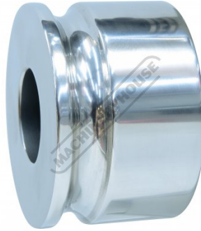
180 Degree Lower Die