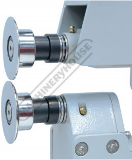
Inside Offset Die with Knife Edge Tipping Die