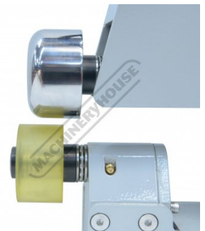
Polyurethane Lower Wheel with Round Tipping Die Side View