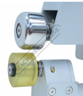
Polyurethane Lower Wheel with Round Tipping Die