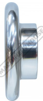
3/8 inch Tipping Die Side View