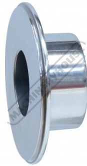
Outside Offset Die