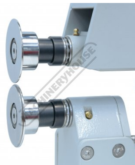
Outside Offset Die with Knife Edge Tipping Die