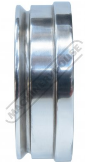
Lower Edge Forming Die Side View