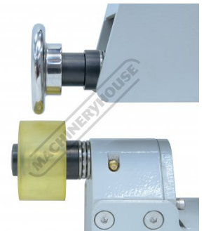
Polyurethane Lower Wheel with 3 8 Inch Tipping Die Side View