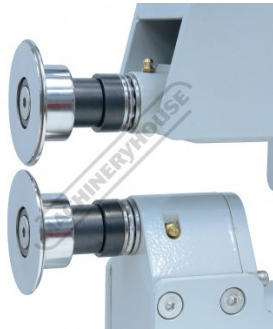
Inside Offset Die with Outside Offset Die