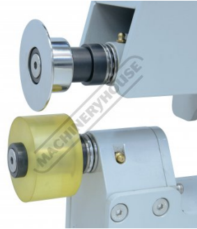
Polyurethane Lower Wheel with Knife Edge Tipping Die