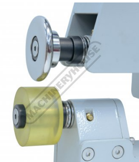
Polyurethane Lower Wheel with 3 8 Inch Tipping Die