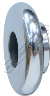
1/2 Inch Tipping Die