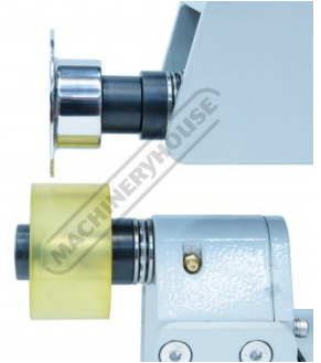
Polyurethane Lower Wheel with Knife Edge Tipping Die Side View