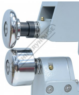
Round Tipping Die with 1 2 Inch Tipping Die