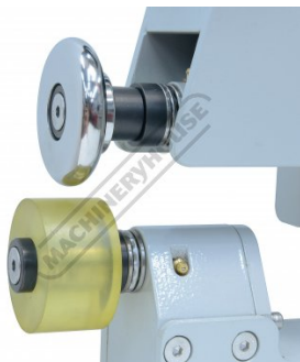
Polyurethane Lower Wheel with 1 2 Inch Tipping Die