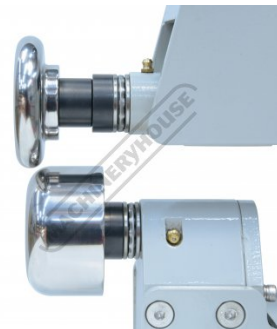
Round Tipping Die with 1 2 Inch Tipping Die Side View