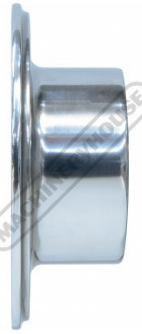
Inside Offset Die Side View