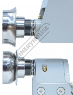
1 Inch Radius Die Set Shown on Machine Side View