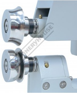
1 Inch Radius Die Set Shown on Machine