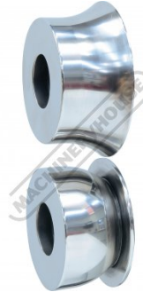
1 1/2 Inch Radius Die Set