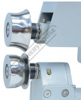
1 1/2 Inch Radius Die Set Shown on Machine