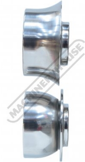
1 1/2 Inch Radius Die Set Side View