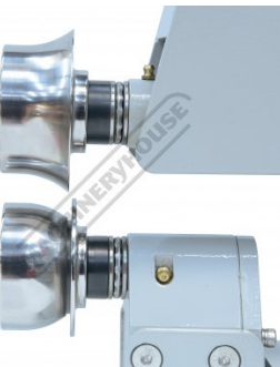
1 1/2 Inch Radius Die Set Shown on Machine Side View