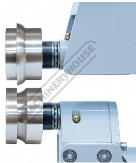
Shown on Machine Side View