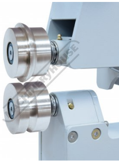
Shown on Machine