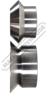
Set 1 Side View