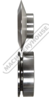
Set 2 Side View