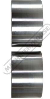
Set 3 Side View