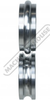
15/32" Beading Dies