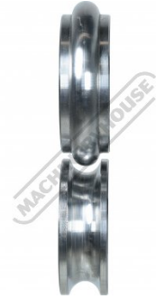
19/32" Beading Dies