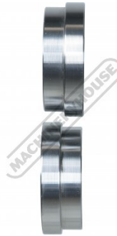
1/8" Flanging Dies