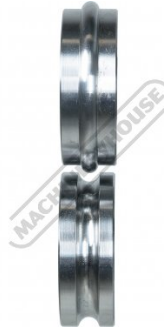
3/8" Beading Dies