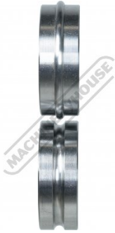
1/4" Beading Dies