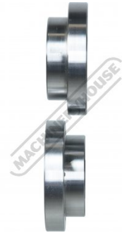
3/8" Flanging Dies