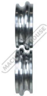
Ogee Beading Dies