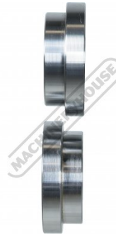
1/4" Flanging Dies