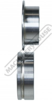
5/32" Beading Dies