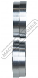
1/16" Flanging Dies