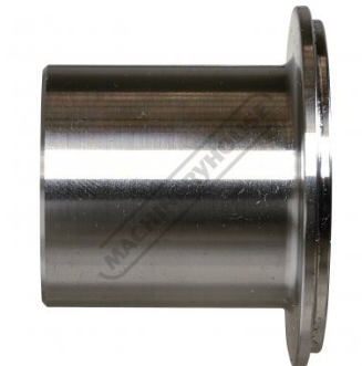
Outside Offset Die Side View (D)