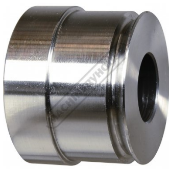
Lower Edge Forming Die (F)