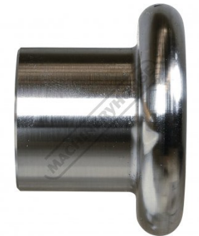
3/8 Inch Tipping Die Side View (G)