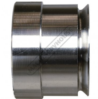
Lower Edge Forming Die Side View (F)