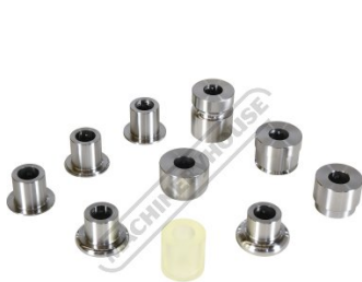
Set Rear View