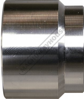
Lower Forming Die Side View (J)