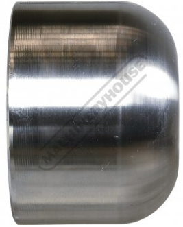
Round Tipping Die Side View (I)