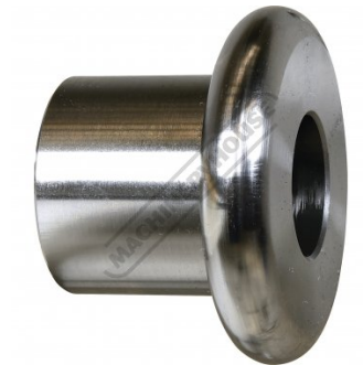
3/8 Inch Tipping Die (G)