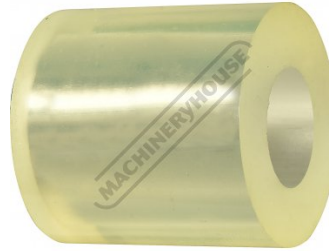
Polyurethane Lower Wheel (A)