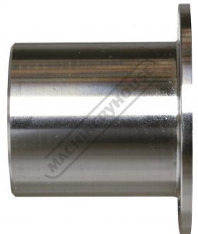
Knife Edge Tipping Die Side View (E)