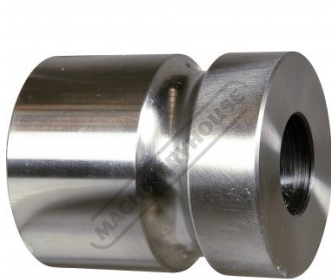
180 Degree Lower Die (B)