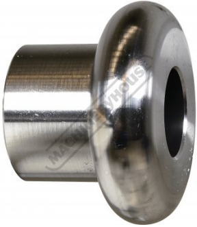
1/2 Inch Tipping Die (H)