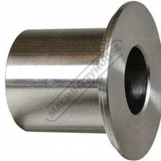
Inside Tipping Die (C)