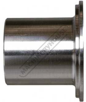
Inside Tipping Die Side View (C)