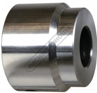
Lower Forming Die (J)