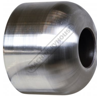
Round Tipping Die (I)