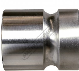
180 Degree Lower Die Side View (B)