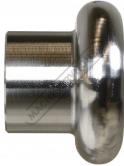
1/2 Inch Tipping Die Side View (H)