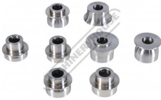
Set Rear Side