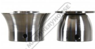
1-1/2" Die Set Side View