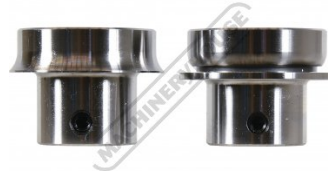
5/16" Die Set Side View