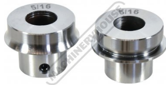
5/16" Die Set