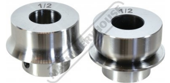
1/2" Die Set