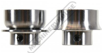
1/2" Die Set Side View