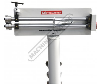
Adjusted To The Rear