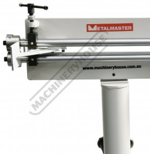
Adjusted To The Front