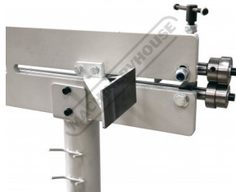
Left Side View Mounted On Machine