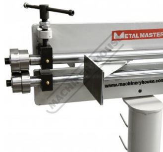
Right Side View Mounted On Machine