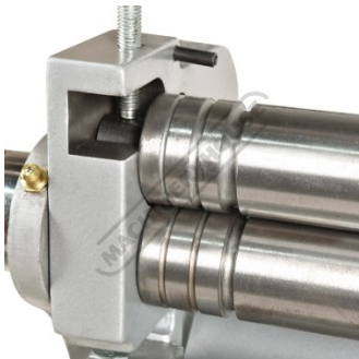
Rear Roll Wire Grooves