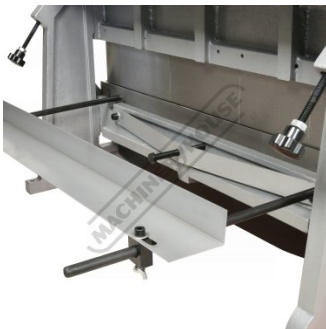
Adjustable Rear Stop