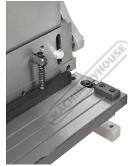
Metal Shearing Clamp