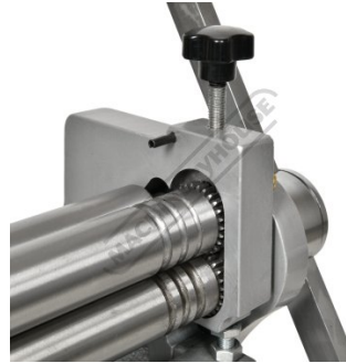
Wire Grooves-G geared Drive