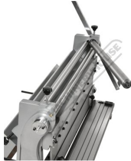
Swing Out Top Roller