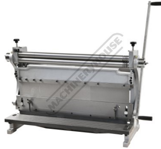
Curving Rolls Full View