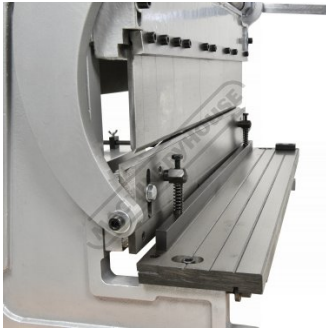
Metal Shearing Blade