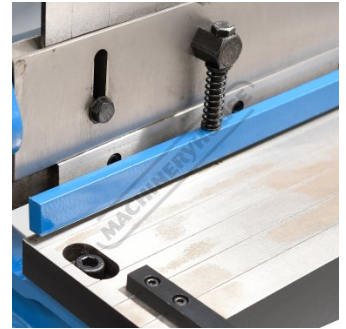
Material Clamp For Shearing