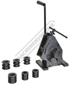
Wire Dies And Tube Rolling Dies Included