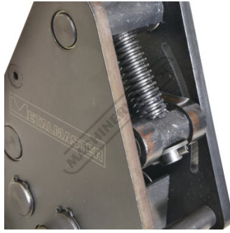
10mm Steel Plate Frame