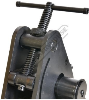
Adjustment Leadscrew With Locking Nut