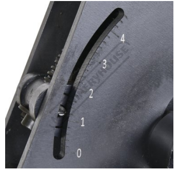
Position Indicator Laser Engraved