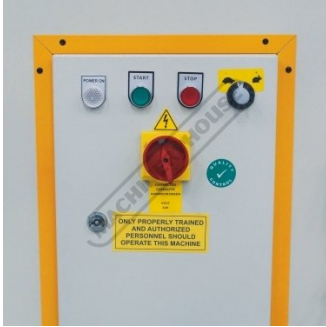
Control Panel with Variable Speed