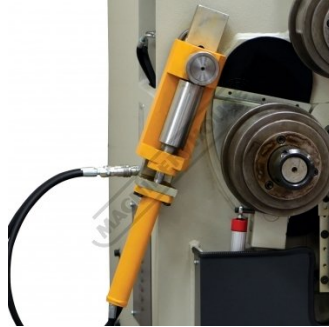
Hydraulic Guide Rollers