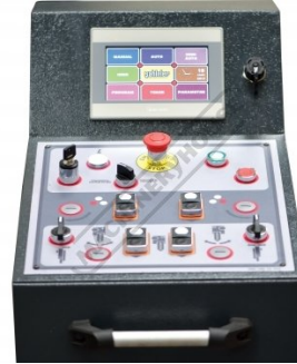
Pedestal Control Box