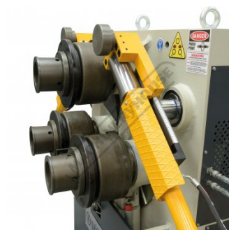
2-Axis Hydraulic Right Lateral Angle Guide Rollers