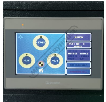
NC Control Auto Screen