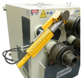
2-Axis Hydraulic Left Lateral Angle Guide Rollers