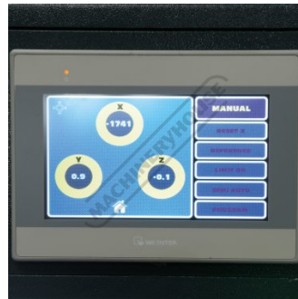
NC Control Manual Mode Screen