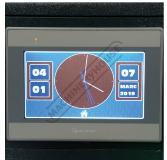
NC Control Time & Date Screen