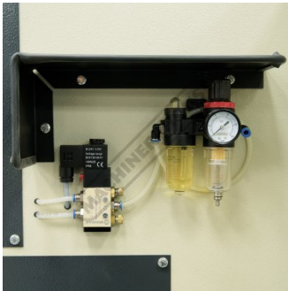
Air Pressure Regulator & Oil Lubricator