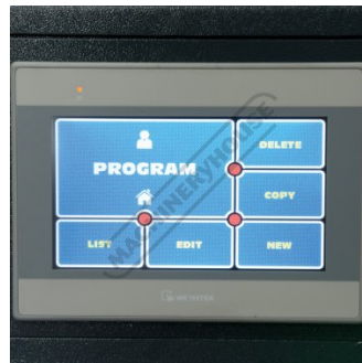
NC Control Program Screen