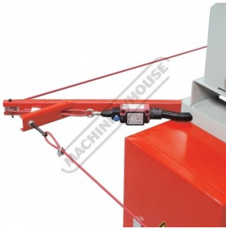
Safety Trip Wire Micro Switch