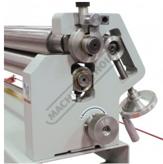
Material Thickness and Curving Roller Adjustment