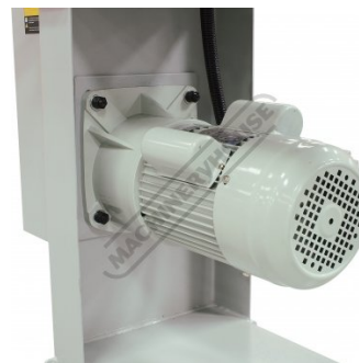
Main Drive Motor