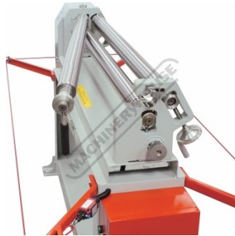
Swing Out Top Roller