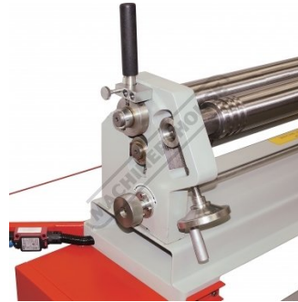
Rear View of Curving Roll Adjustment