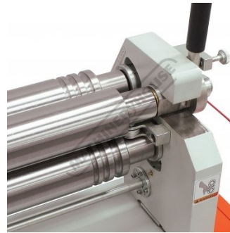
Wire Groove Rolls