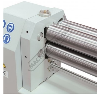
Left View of Rolls