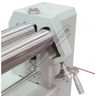
Curving Roller Height Adjustment Right Side