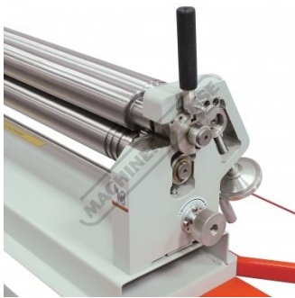
Right View of Rolls