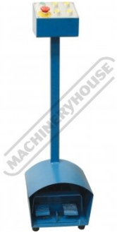
Roving Foot Pedal