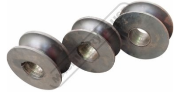
Includes 50mm Pipe Dies