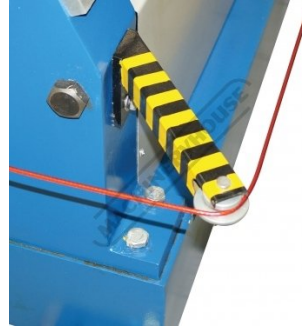
Safety Wire Interlock System