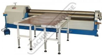
Shown with Optional Ball Transfer Tables