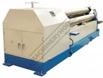
Left Rear View