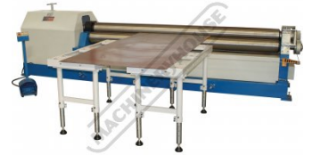
Shown with Optional Ball Transfer Tables