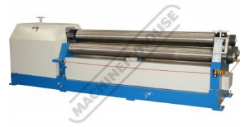
Rear View New