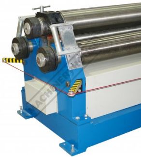
Section Roll End with Flat Bar and Pipe Dies