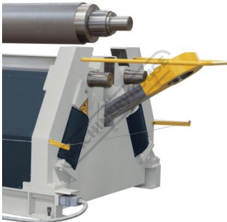
Standard Hydraulic Drop End