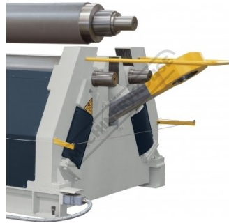
Standard Hydraulic Drop End