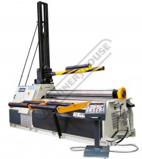
Shown with Optional Overhead Gantry & Hydraulic Lateral Supports