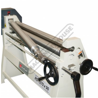
Swivel Top Roller