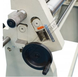
Rear Curving Roll Height Adjustment