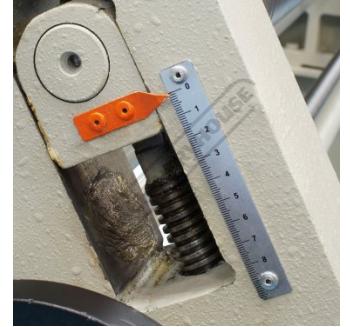
Rear Roll Adjustment Scale