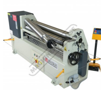
Swing Out Top Roller