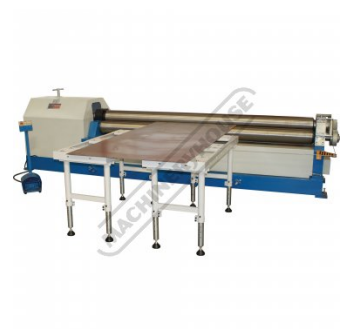
Shown with Optional Ball Transfer Tables