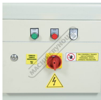
Main Power Control Panel & Isolation Switch