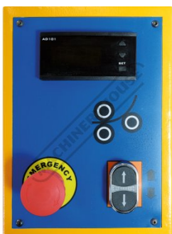
Digital Read Position Display With Emergency Stop