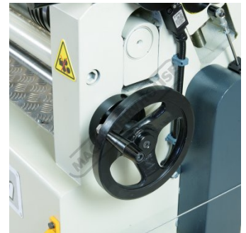
Bottom Roll Material Thickness Adjustment Handle