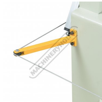
Safety Wire Interlock System Brace