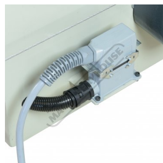
Plug In Foot Control Connector