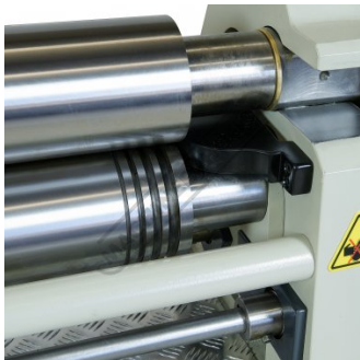
Wire Groove Rolls