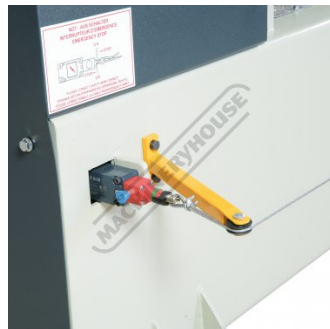
Safety Wire Interlock System