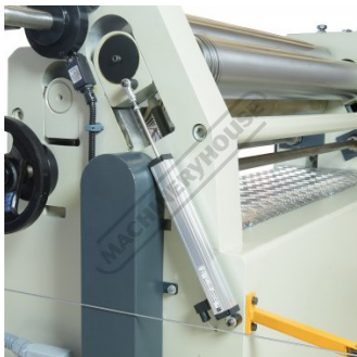
Motorised Rear Curving Roller