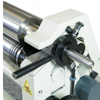
Swing Out Top Roller Handle