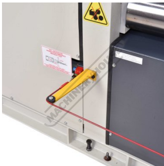
Safety Wire Interlock System