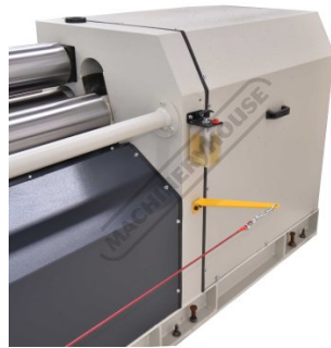
Head Rear View