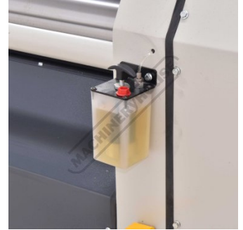
One Shot Lube Pump