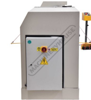
Left End View