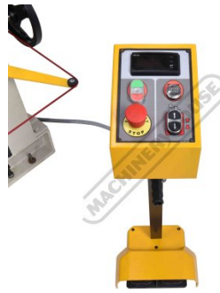
Roving Pendant Controller