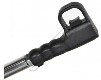
Deadman Trigger Switch