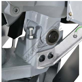
Heavy Duty head Pivot Hinge