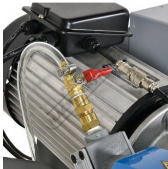
Collant Flow Control Valve