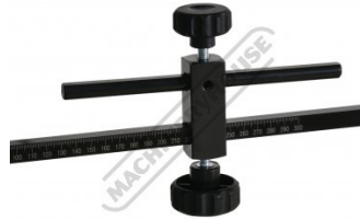
Adjustable Cut Length Stop