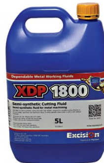
S090 Soluble Metal Cutting Fluid - 5 Litre