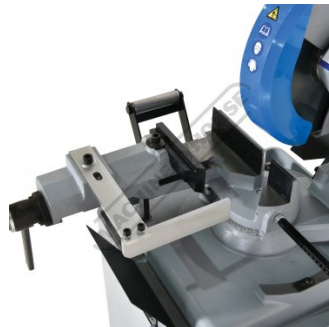
Adjustable Vice Jaws