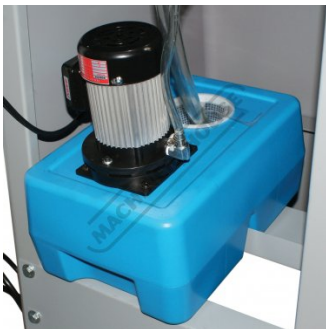
Coolant Pump and Tank