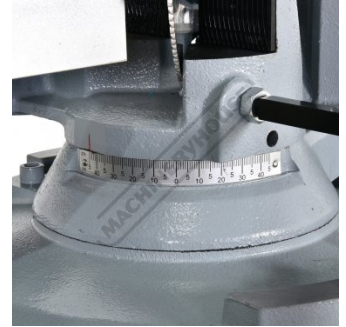
Swivel Head Degree Scale NEW