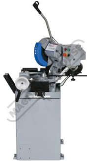
Head Shown at 45 Degrees