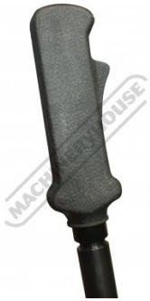
Deadman trigger switch