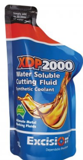
S090A Soluble Metal Cutting Fluid - 1 Litre