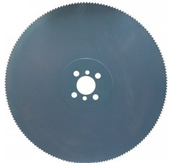
S159N HSS + COBALT Cold Saw Blade